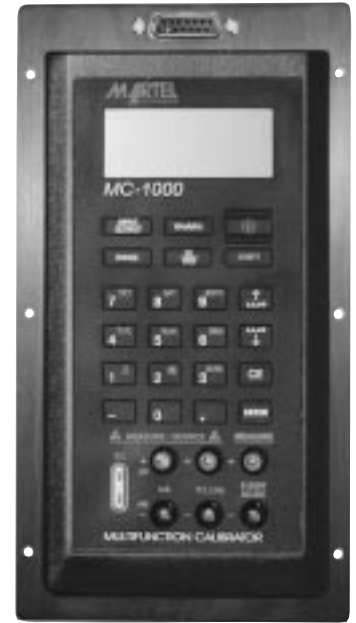
MC1000 with Bezel

To mount the bezel-equipped MC1000, refer to the panel cutout dimensions in the illustration below.